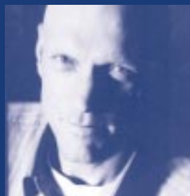
Peter Garrett MP AM Former President Australian Conservation Foundation